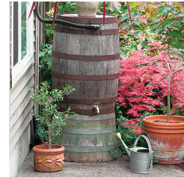
Figure 3—Decorative Rain Barrels